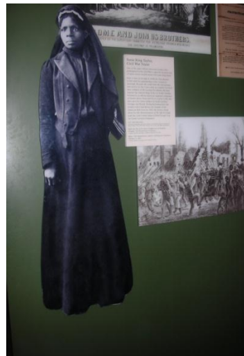
Susie King Taylor